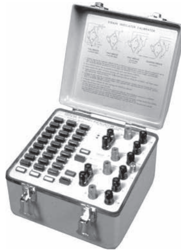
A laboratory standard for verifying the calibration of strain and transducer indicators.