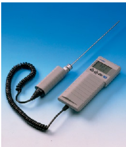
HMI41 with the HMP42 probe.