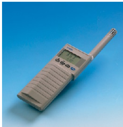
The HMI41 indicator with the HMP41 probe.