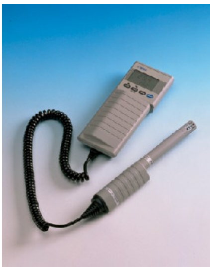
HMI41 with the HMP45 probe.