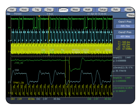
Figure 2. Sophisticated analysis capabilities allow users to fully characterize and document design performance.

The adaptable TDS6000 Series human interface readily supports any operating style and environment. Select traditional instrument-style buttons for navigation or switch to a Windows menu bar. Classic analog-style controls provide instant access to the most frequently used functions while the large touch sensitivity display provides intuitive menu operation. Directly drag waveform positions, cursor locations and trigger level using the touch screen or a mouse. Use a graphical drag-box to select a waveform area for zooming, histogram analysis or measurement gating. Use the MultiView zoom to rapidly navigate and compare multiple waveform regions without losing the "big picture." The USB interface allows a mouse, keyboard and other peripherals to be added without powering off the instrument. With this flexibility, the oscilloscopes readily adapt to a cart, cluttered bench top, shelf, floor and other locations that frequently make operation awkward.