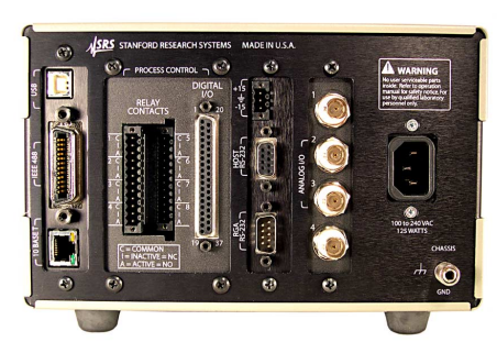
PPM100 rear panel

An embedded web server connects the PPM100 to the world wide web (password protected). The EWS can deliver measurement data to any standard internet browser. Use the EWS to monitor and control your vacuum system or to get automatic email notifications of potential or real system problems.