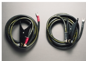
Cable set GA-05052