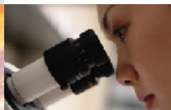
R & D