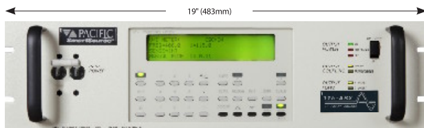
115ASXT-UPC1 Power Source.