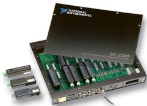
Figure 1. SC-2345 with Configurable Connectors

SCC includes provisions for cascading two SCC analog input modules on a single analog input channel. For example, you can pass an analog input signal through both an attenuator module and a filter module.