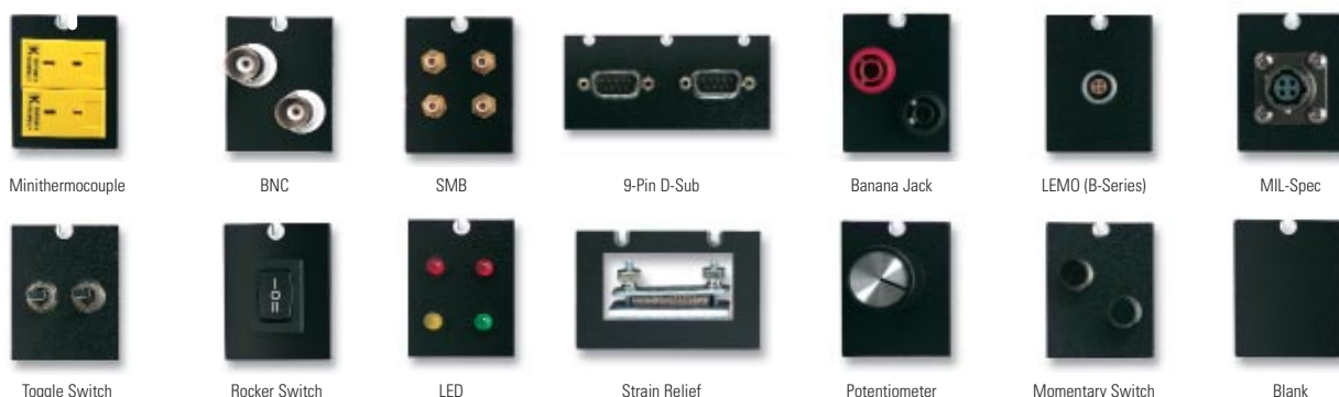
Figure 3. SC-2345 Panellettes Options