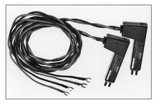
Cat. No. 242011-7 Duplex Helical Current and Potential Hand Spikes. These optional helical hand spikes have pyramid-pointed prods backed by stout springs and helical guides that rotate the prods when pressure is applied to the handles. This feature ensures good contact and allows operation at precise angles. Maximum allowable test current is 20 A.

Shipping, with 30 ft (10 m) leads: 80 lb (36 kg)