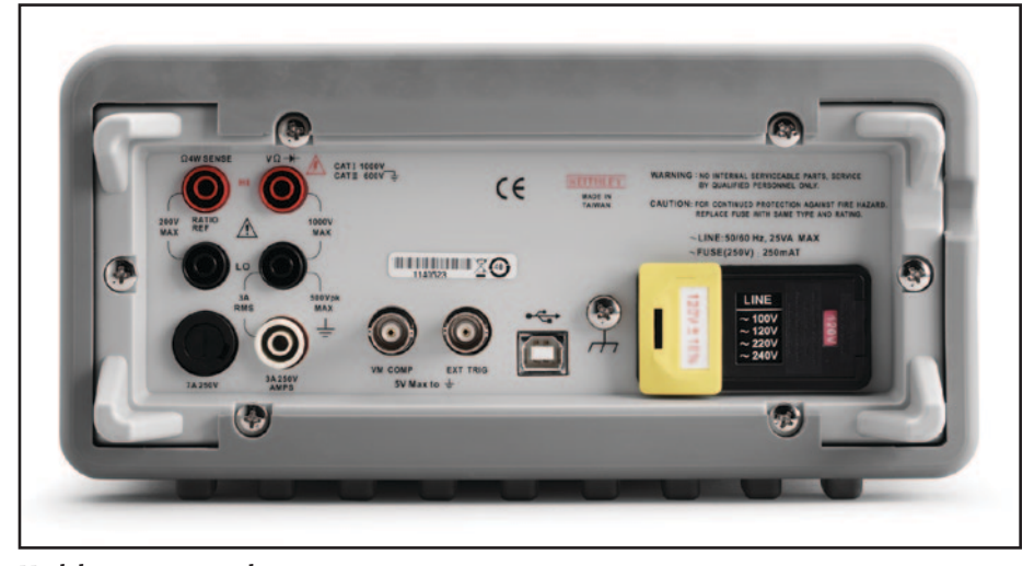
Model 2100 rear panel

1.888.KEITHLEY (U.S. only) www.keithley.com