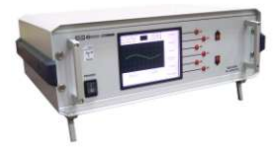
DDX Series Partial Discharge Detectors