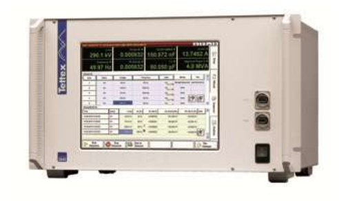
2820a & 2840 C / tanδ bridges