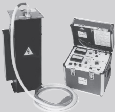
PTS-200 Model (0-200 kVdc, 5mA)