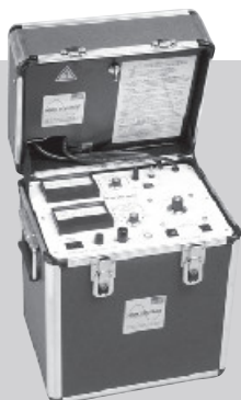
PTS-75 Model (0-75 kVdc, 10mA)

Two HV Portable DC Test Sets for the Price of One!