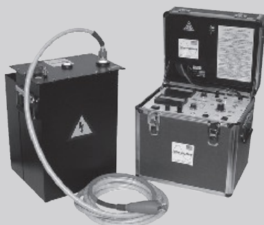
PTS-130 Model (0-130 kVdc, 10mA)