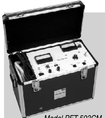
Model PFT-503CM (0-50 kVac)

0-10 kVac, 0-30 kVac, 0-50 kVac and 0-100 kVac