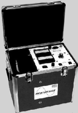
Model PFT-301CM (0-30 kVac)