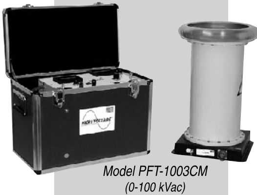
Model PFT-1003CM (0-100 kVac)