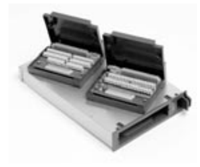
Universal Input Module

Fluke's patented Universal Input Module is included with all Fluke data acquisition products, providing unparalleled thermocouple accuracy and compatibility with a broad range of diverse inputs. The Universal Input Module enables you to easily measure just about any electrical or physical parameter without changing hardware or adding external signal conditioning. You can connect any combination of dc voltage, ac voltage, thermocouples, current, RTD, resistance (2- or 4-wire), or frequency measurement inputs directly to the input module.