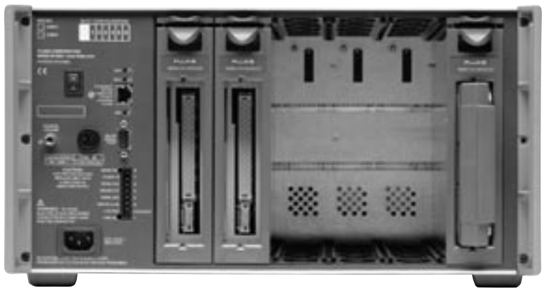
Easy access to expansion slots and rear panel

System Requirements: IBM compatible, Pentium II processor, 333 MHz Microsoft Windows NT/98/2000/XP 64 MB RAM 150 MB free hard disk space VGA or SVGA display, 100% IBM compatible with 2 MB Video RAM (VRAM) CD-ROM Drive Microsoft Internet Explorer 4.0 or later