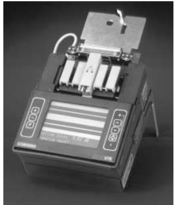
Model X75 Micro Fusion Splicer | Photo SEH141