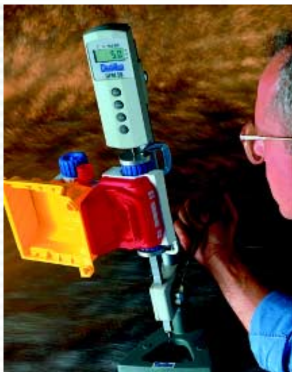
DFM with LTS Series Mechanical Stand

SPECIFICATION SS-FM-3110-0801 August 2001