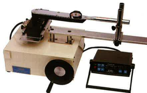
Part Number 250L-1 Loader Shown with Digitest 950-DT Calibrating a PET-C Electronic Torque Wrench