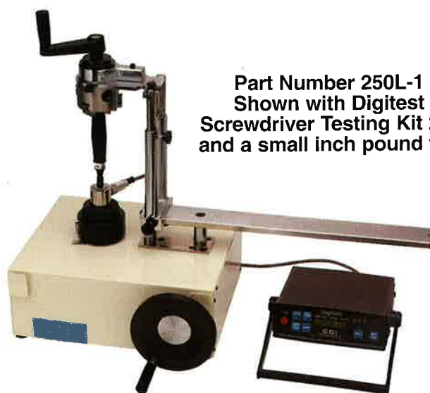
Part Number 250L-1 Loader Shown with Digitest 950-DT Screwdriver Testing Kit 2500-3-01 , and a small inch pound transducer