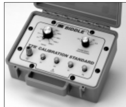
Optional Calibration Standard, Cat. No. 550555

The Calibration Standard has been designed for use as a reference transformer for checking the accuracy of the BIDDLE Three-Phase TTR. The standard is also useful for troubleshooting and repairing the instrument. The Calibration Standard is available with a Calibration Certificate of turns ratio and phase shift accuracy traceable to NIST.