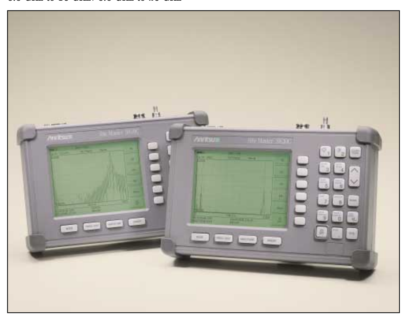
The World's Leading Handheld Microwave Transmission Line and Antenna Analyzer

MicrowaveTransmission Line and Antenna Analyzer 3.3 GHz to 10 GHz/3.3 GHz to 20 GHz