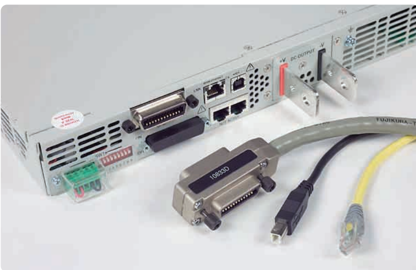
Figure 2. Built-in Ethernet, USB 2.0, and GPIB interfaces enable easy system connections