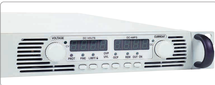
Figure 1. Front-panel control knobs and buttons make it easy to use N5700 power supplies.

To safeguard your device from damage, the N5700 Series power supplies provide over-temperature, over-current and over-voltage protection (OVP) to shut down the power supply output when a fault condition occurs. They also offer an under-voltage limit (UVL) that prevents adjustment of the output voltage below a certain limit. The combination of UVL and OVP capabilities lets you create a protection window for sensitive load circuitry.