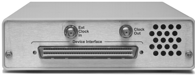
Figure 3. Rear panel clock connectors. Clock the interface module through the device interface bus or the external clock input port. Take the output clock signal from the device interface bus or from the clock output port.