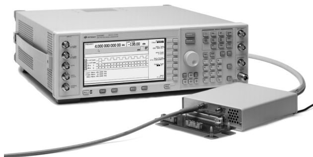
Figure 1. The interface module with the ESG and a single breakout board ready to be connected to a device under test.

The N5102A Baseband Studio digital signal interface module provides fast and flexible digital inputs or outputs for your E4438C ESG or E8267C PSG vector signal generator. In output mode, you can deliver realistic complex-modulated signals such as W-CDMA, 1xEV-DV, custom pulses, WLAN, TDMA and many others directly to your digital transceivers, components and subsystems. In the input mode, the interface module matches your digital input to the signal generator's baseband system, providing a flexible and calibrated way of upconverting to analog IF, RF or uW frequencies. The interface module adapts to your device with a wide variety of data formats, clock features, and signaling. With its selection of logic types and connector types, the interface module connects easily into your test system, in most cases eliminating the need for custom fixtures.