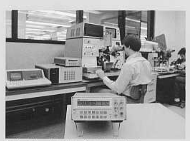
Printhead characterization in Production Engineering.

The 3478A uses an integrating analog to digital conversion technique to give you ample noise rejection. In a system, the ability to reject noise provides you with more repeatable measurements. You can select a display of 3½, 4½ or 5½ digits for faster measurement speed or for additional noise rejection. For example, with a display of 3½ digits selected, the 3478A can take a maximum of 71 readings/second. When you increase the resolution to 5½ digits, reading speed is reduced to 4.4 readings/second and noise rejection is greatly increased.