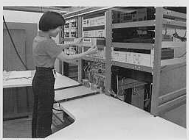
Building an HP-IB automatic test system.

Besides simply providing data to the computer, the 3478A has an SRQ interrupt capability that lets you know precisely when the data is ready. This feature and other SRQ interrupt capabilities built into the 3478A allow you more efficient use of your computer time.