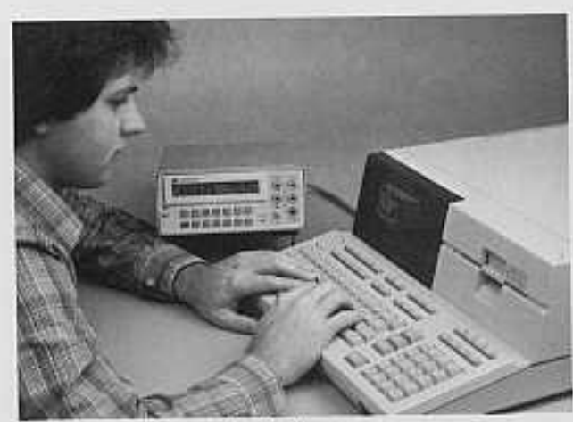
Easily develop programs for HP-IB systems

HP-B: Not just IEEE 488, but the hardware, documentation and