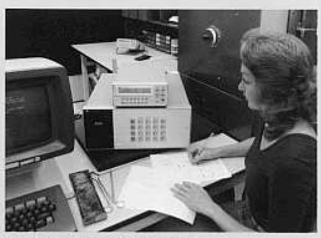
Stress testing new ICs under development.