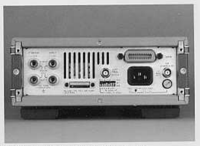
Switchable rear inputs and synchronizing signals.

A Voltmeter Complete output on the rear panel of the 3478A provides you with a signal that occurs after a measurement is completed. This output signal lets you conveniently advance an HP scanner to the next channel so you can enhance scanning speed. The External Trigger input lets you initiate a measurement in the 3478A and synchronize with an external device.