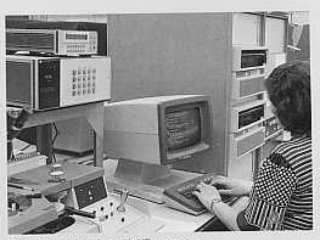
Production automation with HP computers.

Many conveniences, such as front/rear inputs, HP-IB enhancements, synchronizing signals, and a rack mountable package are built into the 3478A to give you more performance and ease of use in your system.