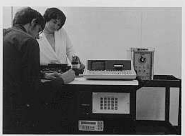
Production testing of temperature probes.

*T<sub>Cal</sub> is the temperature of the environment where the 3478A was calibrated. Calibration should be performed with the temperature of the environment between 20°C and 30°C.