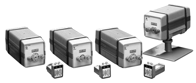
HP 11970, 11974 Series Mixers