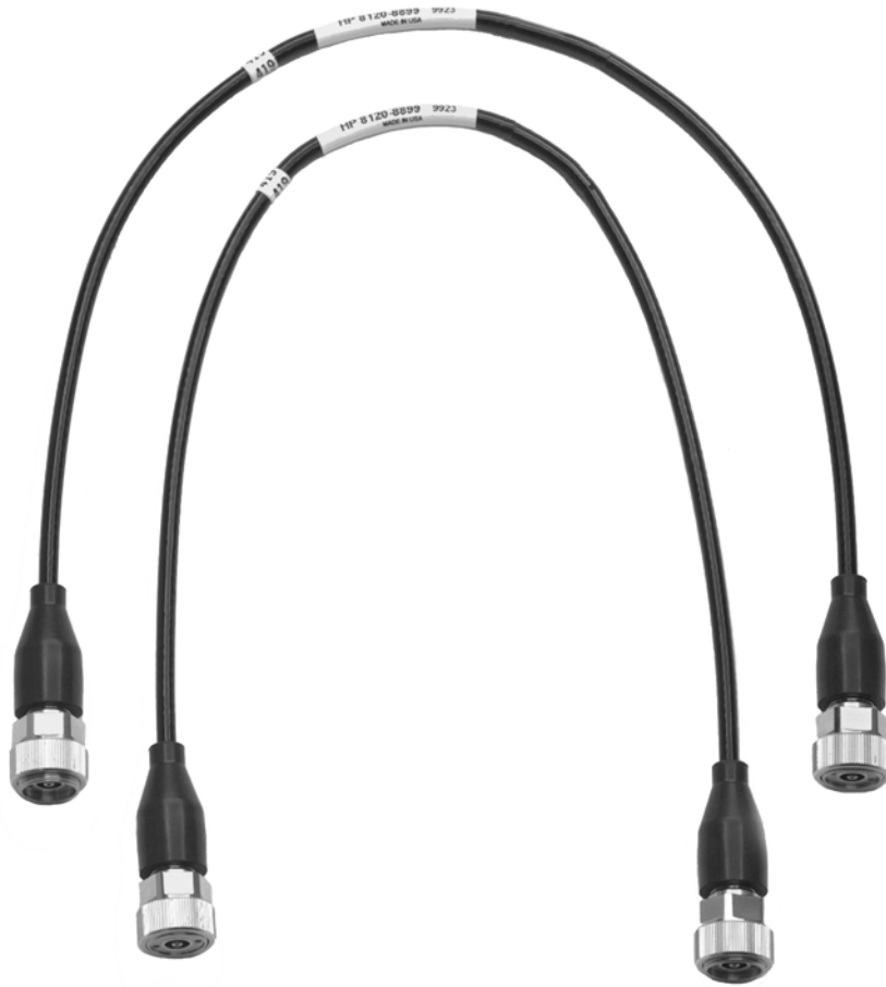
Figure 1. Model 11857D Cables, Option B24