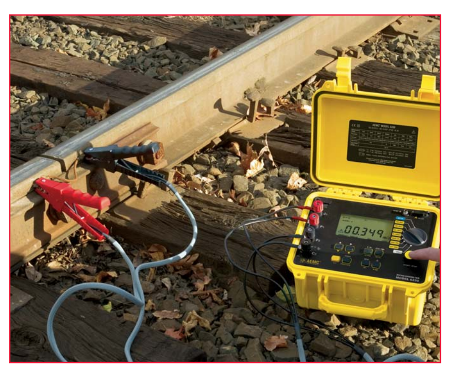
Verifying rail bonds with the Model 6250