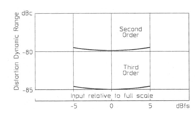
Typical harmonic and intermodulation distortion

Second order < -75 dBc (-80 dBc typical) Third order < -75 dBc (-85 dBc typical)