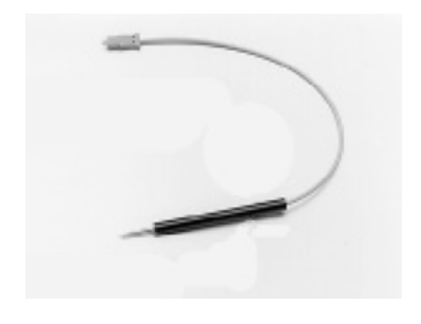
16006A pin-type probe lead Cable length, 0.4 meter. Spring-loaded probe tips for firm contact. Useful for manual contact measurements. One lead supplied only.