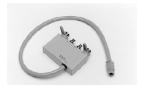
16143B mating cable Interface between test leads and 4338B. Cable length, 0.5 meter.

Alligator clip lead. Cable length, 0.4 meter. Each test lead has a separate alligator clip voltage and current terminal. One lead supplied only.