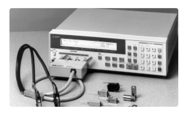
Use the milliohm meter for electromechanical contact testing.