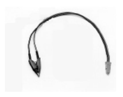
16005B Kelvin clip lead (large) Cable length, 0.4 meter. Jaws mate with large terminal devices. One lead supplied only.