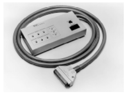
16064B LED display/trigger box Displays comparator status. Cable length, 1.5 meters. External trigger.