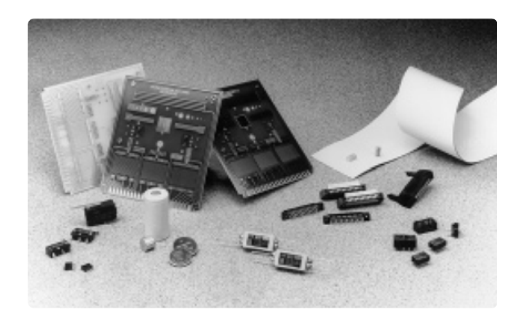
Make precise ultra-low resistance measurements with the 4338B.