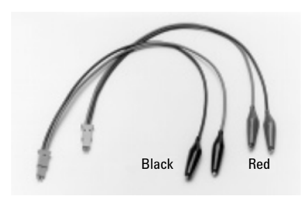
16007A alligator clip lead (red clip) 16007B alligator clip lead (black clip)

Cable length, 0.4 meter. Small contacts for devices with fine leads. One lead supplied only.