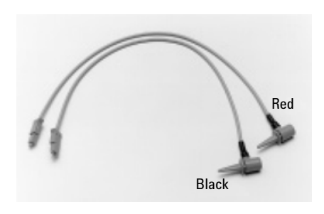
16005C Kelvin IC clip lead (red clip) 16005D Kelvin IC clip lead (black clip) Cable length, 0.4 meter, Small

Cable length, 0.4 meter. Small contacts for devices with fine leads. One lead supplied only.