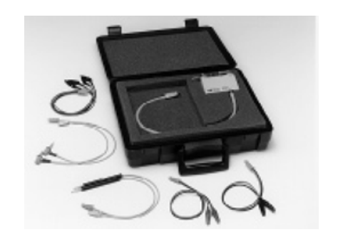
16338A test lead kit

Contains one each of the following: 16143B, 16005C, 16005D, 16007A, 16007B, carrying case. Contains two each of the following: 16005B and 16006A.