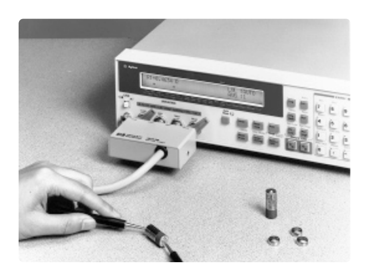
The 4338B is ideal for battery evaluation.