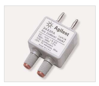
34330A 30A Current Shunt