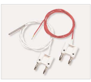
E2308A Thermistor Probe