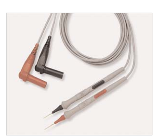
34133A Precision Electronics Test Leads