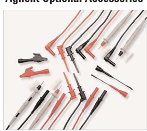
34132A Deluxe Test Lead Kits