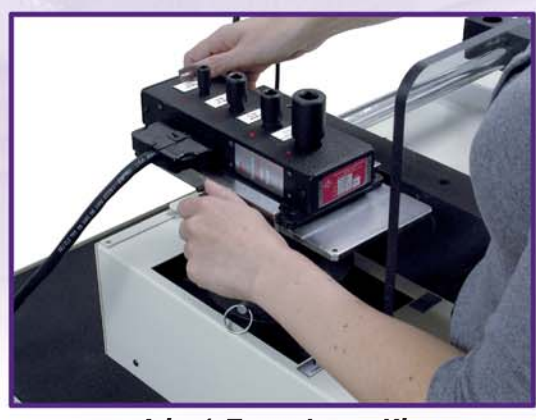
4 in 1 Transducer Kit with Mounting Adapter