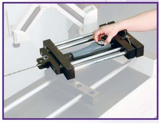
Compression Gauge Testing Kit