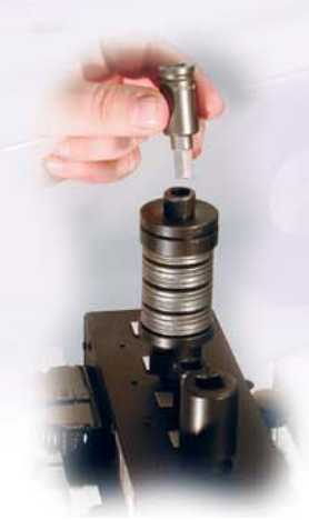
Joint Rate Simulator with Adapter Bit