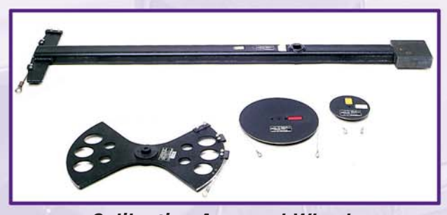
Calibration Arms and Wheels