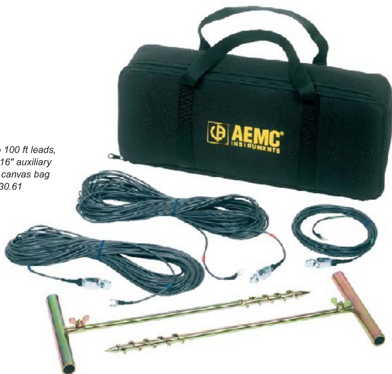
Test Kit includes two 100 ft leads, one 16 ft lead, two 16" auxiliary ground electrodes, canvas bag Catalog #2130.61