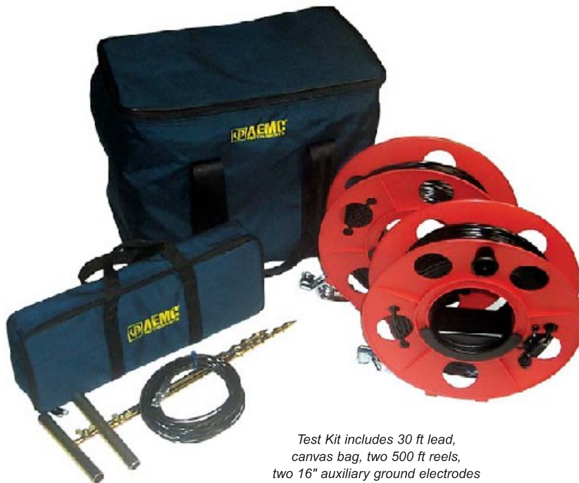
Test Kit includes 30 ft lead, canvas bag, two 500 ft reels, two 16" auxiliary ground electrodes Catalog #100.525