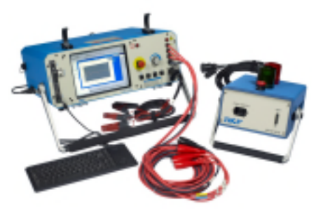
The Baker ZTX accessory (at right) works with Baker AWA-IV analyzers to enable tests on lowimpedance DC motor components