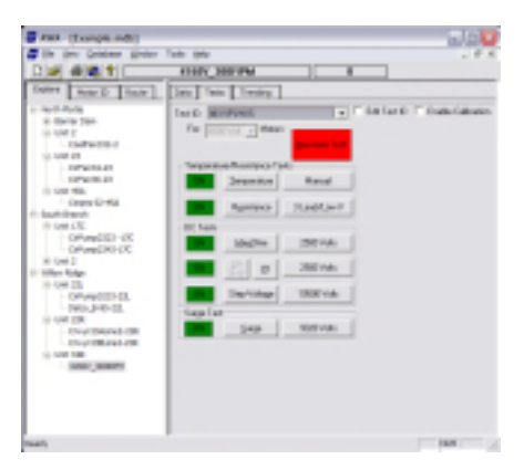
Baker AWA-IV test ID selection screen