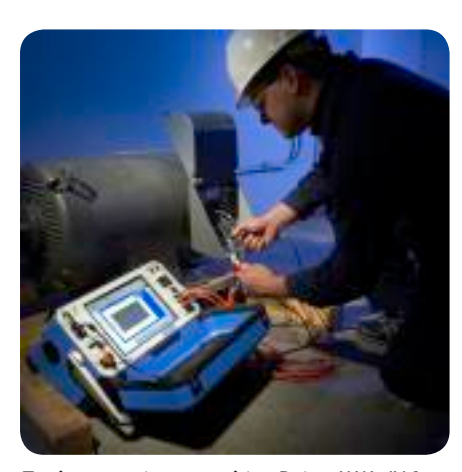
Testing a stock motor with a Baker AWA-IV for quality assurance before placement in service

When tests are completed, the analyzer automatically indicates which tests have passed or failed. Graphical information and analysis for each motor is stored and can be reviewed on the analyzer's LCD screen to identify trends that may indicate potential problems. No analysis on the part of the user needs to occur in the field; data can also be saved to a server or PC database for later retrieval on a desktop or laptop computer.