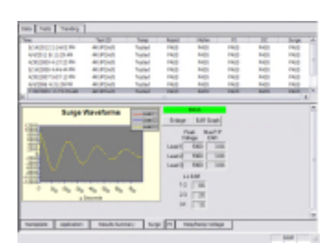
Baker AWA-IV screen with surge test results

The Baker AWA-IV family includes models designed to perform tests at maximum voltages from 2 000 on up to 12 000 volts. Models include 2 kV, 4 kV, 6 kV, 12 kV and 12 kV HO (high output). The 2 kV and 4 kV models have a smaller case than 6 kV and 12 kV models (see specifications for each model on the back page for dimensions and weight). These analyzers can be coupled with SKF static motor analyzer power packs to boost test voltages to 24 or 30 kV for tests on large motors.