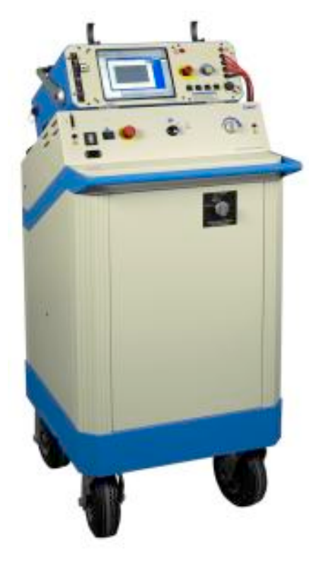
The Baker AWA-IV coupled with a Baker PP30 power pack unit enables testing on high-voltage motors and generators

Increase the test capability of the Baker AWA-IV by coupling with an SKF power pack. The Baker PP24, Baker PP30 and Baker PP85 power packs are high-voltage test generators that enable testing of high-voltage windings. The output voltage is controlled by a variable transformer that produces up to 30 000 volts. Power packs perform both surge and DC hipot tests when used with a Baker AWA-IV as the control, recorder and display unit.