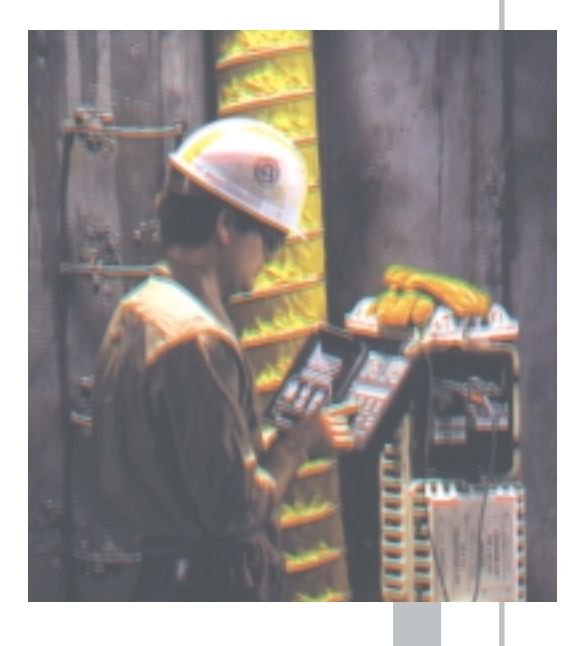
Powerful and compact, the T-BERD 107A fully tests the T1 Span.

The Smart Loopback/Command Codes Option enables the technician to isolate problems anywhere along the network with minimal circuit downtime. Use intelligent repeater technology to qualify and maintain circuits in the field and non-intrusively query performance data. Span problems can be sectionalized remotely before dispatching maintenance personnel.