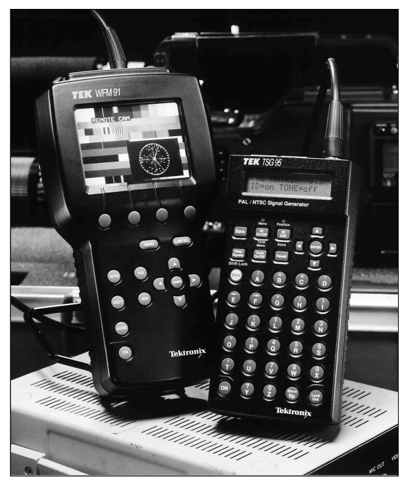
The Tektronix TSG 95 is an ideal companion for the WFM 90 Series Waveform/Vector/Picture/Audio Monitors.