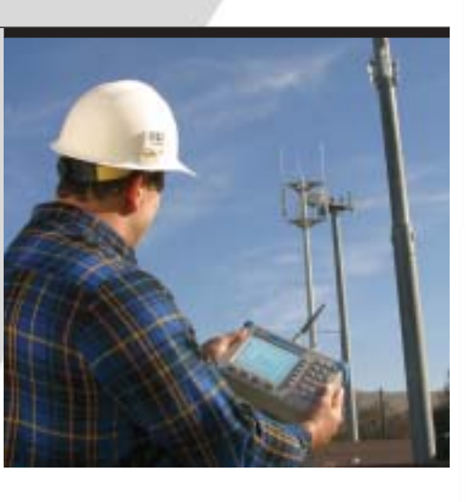
The Cell Master from Anritsu is a single instrument that combines all of the tools required to simplify the job of maintaining and troubleshooting base stations.