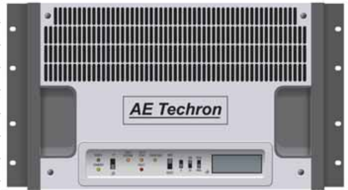
AE Techron 7782 Amplifier

The 7782 can operate in either voltage or current operation modes and is DC coupled.