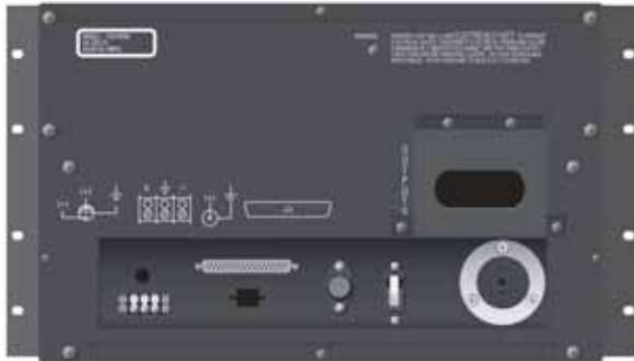
7782 Back Panel

*Output peak power is dependant on load, signal and % duty cycle. Please contact your AE Techron Representative for details.