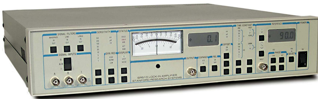
SR510 Lock-In Amplifier

An internal voltage-controlled oscillator provides both an adjustable-amplitude sine wave output and a synchronous, fixed-amplitude reference output. The sine wave amplitude can be set to 0.01, 0.1 or 1 Vrms, and it can drive up to 20 mA. The oscillator frequency is controlled by a rear-panel voltage input and can be adjusted between 1 Hz and 100 kHz. Typically, the sine wave output is used to excite some aspect of an experiment, while the reference output provides a frequency reference to the lock-in.