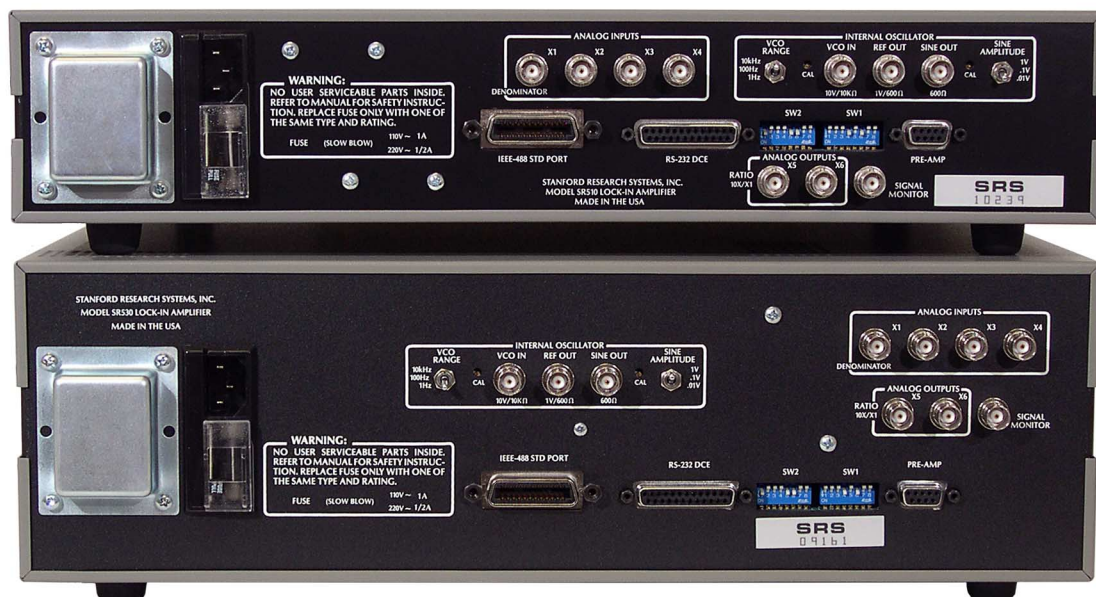
SR510 and SR530 rear panels (with opt. 01)